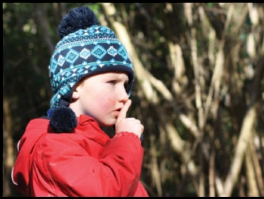
'You can hear from the front.' Barnaby (4:8)